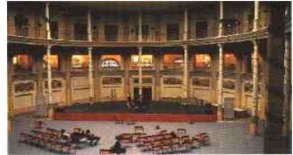
Casa dell'Architettura - Acquario Romano Piazza Manfredo Fanti, 47

Before the dinner a guided tour to the Domus Romane in Palazzo Valentini will be organised.