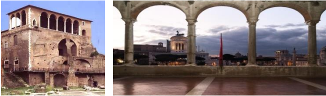
Casa dei Cavalieri di Rodi Piazza del Grillo, 1

On the 12 th of June all conference participants are welcomed to a gala dinner in a unique location, the terrace of the Casa dei Cavalieri di Rodi , located in the Foro di Augusto.